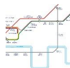
Black History Tube Map

Naturally, I looked at our closest station and, as the DLR line is not on the map, this meant looking to see who was named at North Greenwich. Whilst I will leave our pupils to find the name on the map, I will comment on the wonderful jazz that I have just listened to as I researched this individual and his incredible musical talent! A small extract from the map with the relevant station is below: